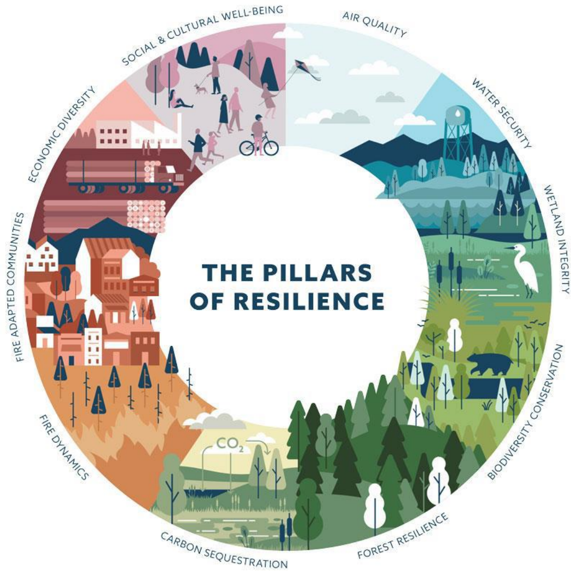
Figure 2 Pillars of Resilience